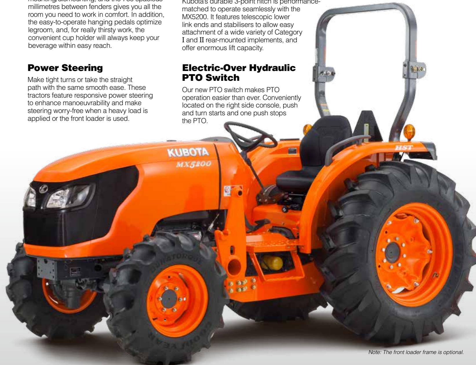
Note: The front loader frame is optional.