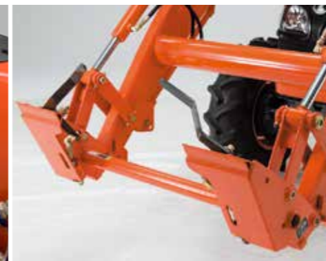
2-lever Quick Coupler